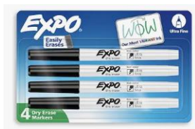
Expo Fine Tip White Board Markers