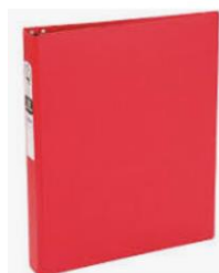
1" Red Binder